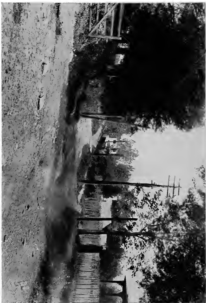
WALL (ON THE LEFT OF ROAD) AT MARYE'S HEIGHTS CHANCELLORSVILLE AND FREDERICKSBURG BATTLEFIELDS